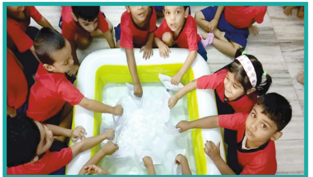
Our Nursery Schools students enjoying Paper Boat activity.