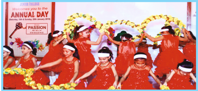
A memorable performance by the students of Crescent English High School during their Annual Day.