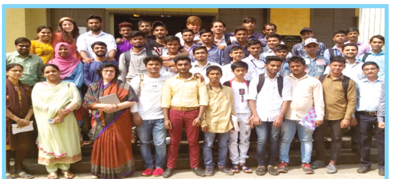
A Group photo of our Vocational Training Students after attending a Grooming / Soft Skill sessions.