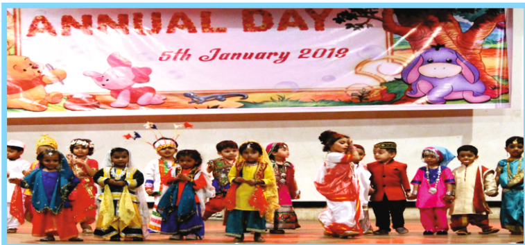
Tiny Tots of Angels' Paradise Schools Performing during their Annual Day Programme at R. D. National College, Hall, Bandra.