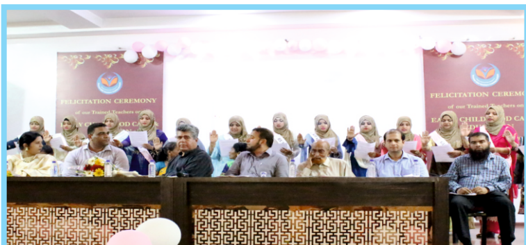
The Teacher Trainees of ECCEd taking an oath of dedication & honesty towards their profession.